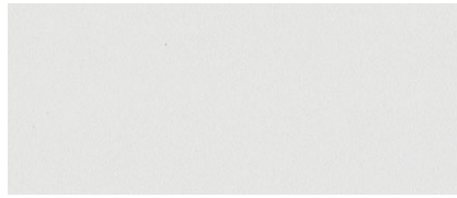
Lichtgrau / Light grey