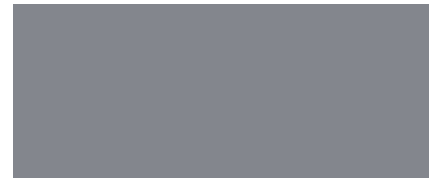
Staubgrau / Dust grey