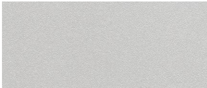
Silber / Silver