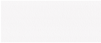
Weiß / White